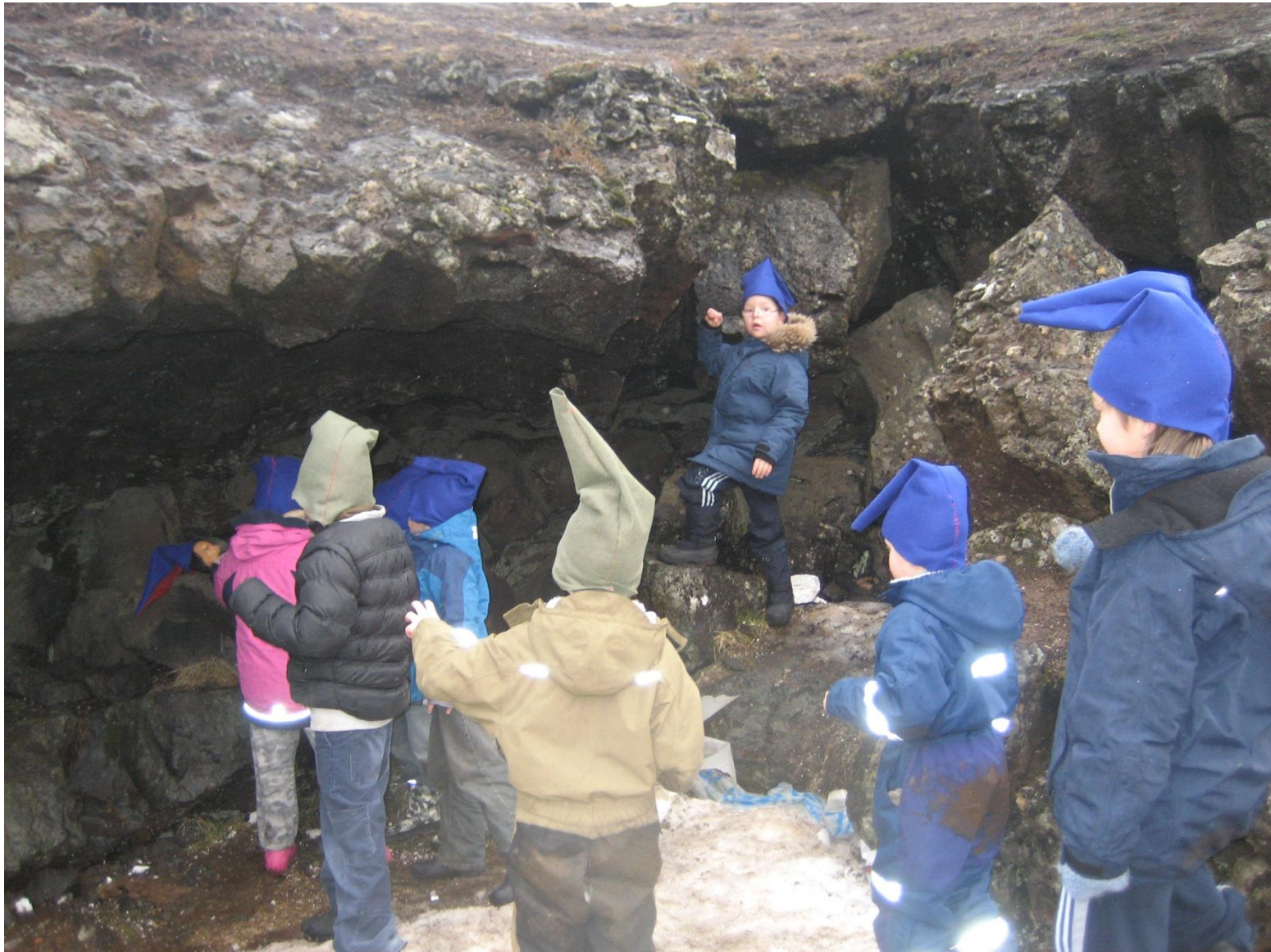
One of many caves in the schoolyard