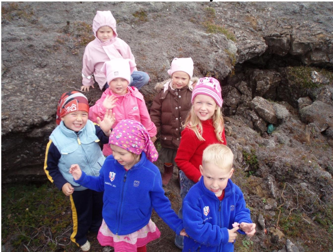
Children playing in the schoolyard